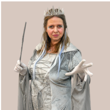
The White Witch

Aslan is a Lion. He can be frightening but he is good and helps the children. He will help defeat the White Witch.